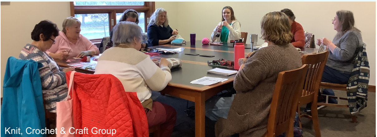
Knit, Crochet & Craft Group