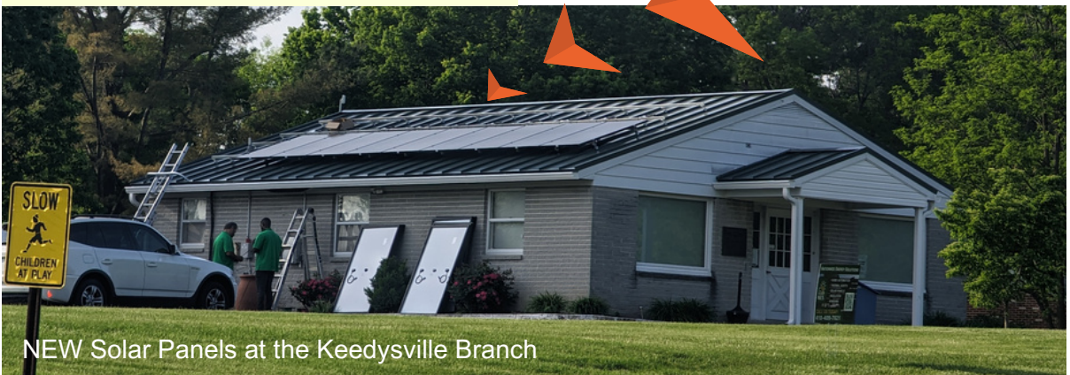
NEW Solar Panels at the Keedysville Branch

It's time to get creative! Teens can make all kinds of crafts with supplies from the Teen Box, including friendship bracelets, duct tape wallets, or origami.