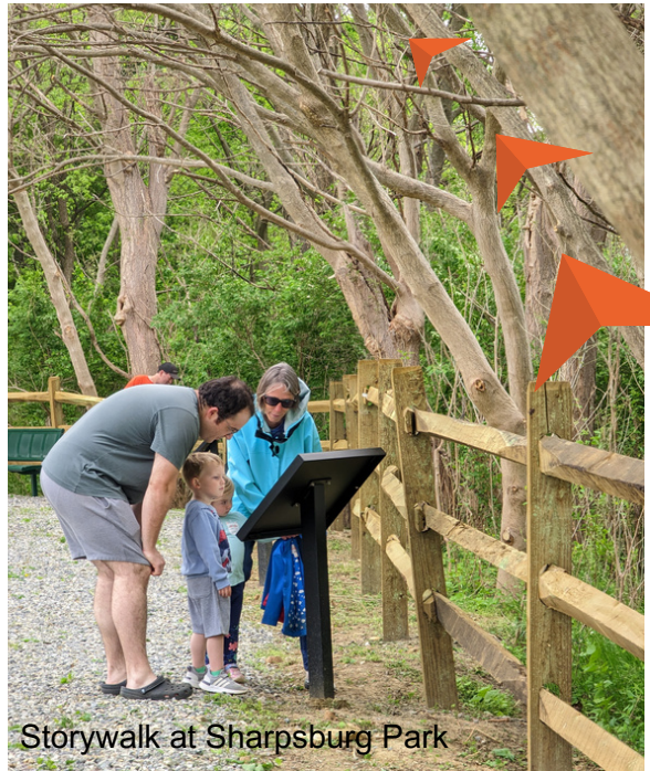
Storywalk at Sharpsburg Park

Stop in and make a decorative pin out of colorful puzzle pieces. Ages tween+