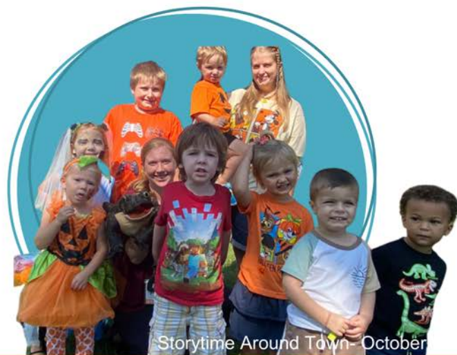
Storytime Around Town - October