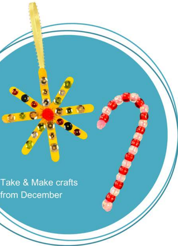
Take & Make crafts from December

February Kits: Hearts and Bookmarks! Craft a puffy heart or make a bookmark