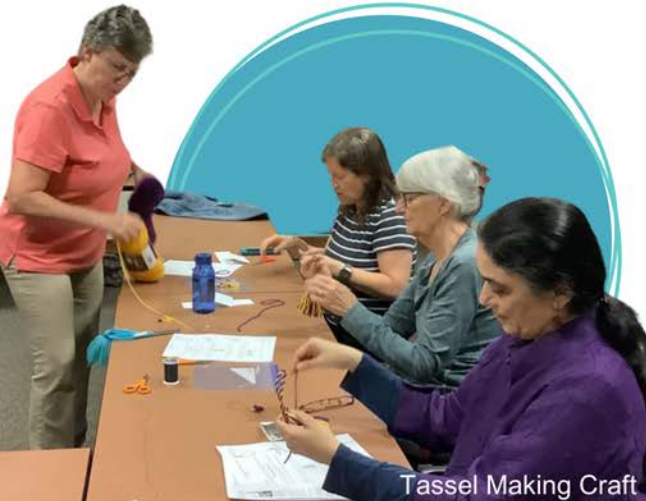
Tassel Making Craft