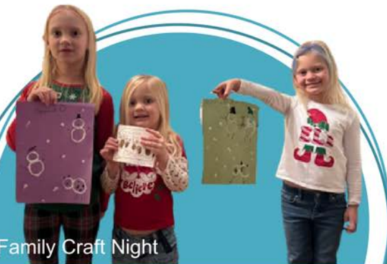
Family Craft Night

4/23: Share poetry and create our own poem